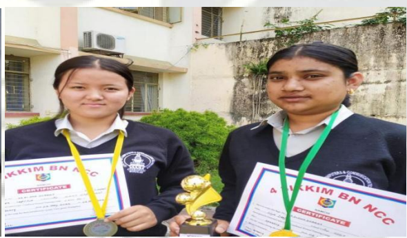
NCC CCCT, Chisopani: CCCT Chisopani had deputed 10 no cadets of CCCT NCC for a 10 days long CATC-1 NCC camp at Kamrang , Namchi from 4/05/2022 to 13/05/2022

Out of 10 cadets participated, 10 cadets were from Senior Division girls (SW).